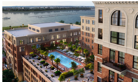
Aerial view of The Jasper

Situated in Harleston Village at the gateway to Charleston's Historic District, The Jasper offers serious luxury living.