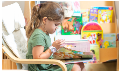
Pro-tip: Read your favorite children's books to your own child

Today is National Read Across America Day. In honor of the holiday, we're exploring the benefits of reading aloud to your child + why it's important to carve out quality time with your kid while enhancing their academic mind.